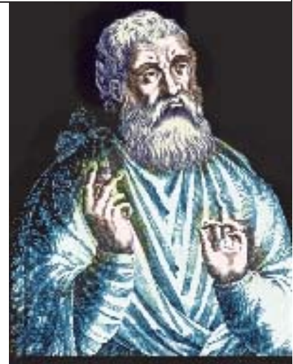
St. Justin Martyr, our Patron, pray for us!!

What's Wrong with Abortion/ Contraception?